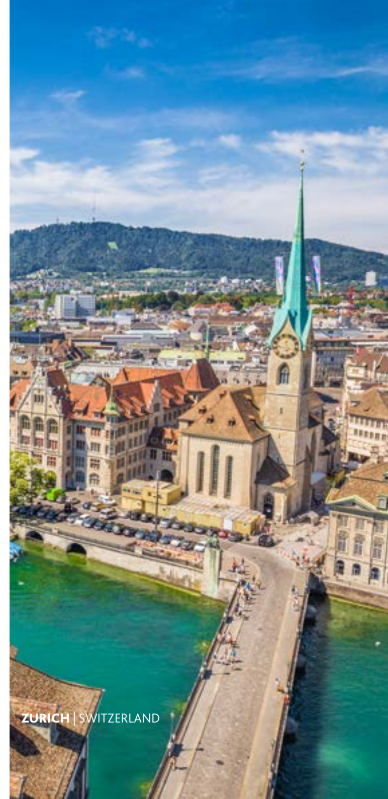
ZURICH | SWITZERLAND

Normal tax rate for capital gains and dividends in respect of listed securities is 30%. There is also an alternative taxation for listed securities with a 0.45% tax on the value of the securities.