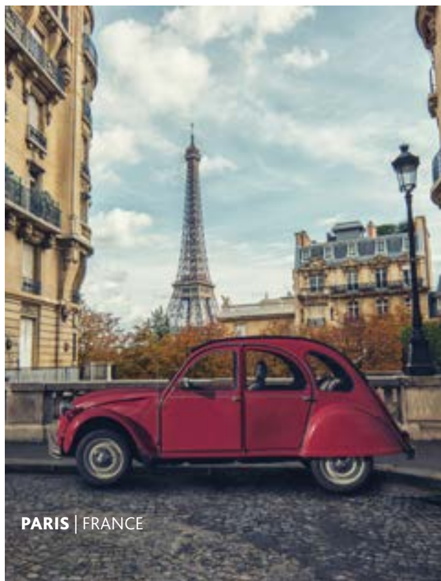
PARIS | FRANCE

In addition, an exemption from wealth tax applies for a period of up to six years for all new French tax resident individuals in respect of real estate and rights therein located outside France.