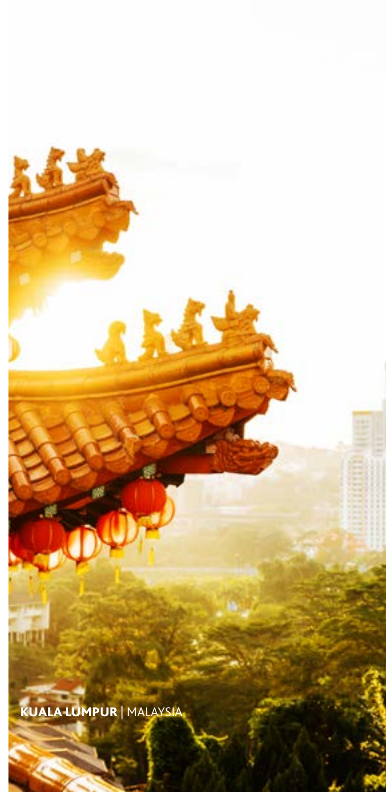
KUALA LUMPUR | MALAYSIA

Returning residents may qualify for a ten year exemption from income tax when returning to work in Mauritius, provided they meet specified conditions. The exemption is applicable for all foreign source income and for income derived in Mauritius in respect of emoluments, income from business, trade, profession or investment.