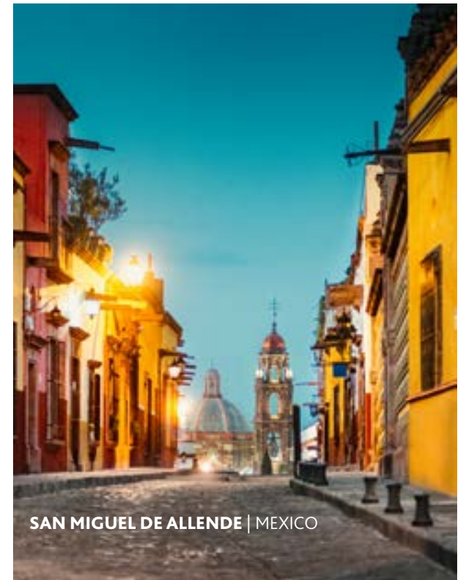
SAN MIGUEL DE ALLENDE | MEXICO

Additionally, the country is expected to become a Latin American powerhouse in data centre services. Retailers in Mexico are expected to significantly increase their actual investment in CRM, ERP, supply chain management and BI, as a consequence of a fast growing retail market.