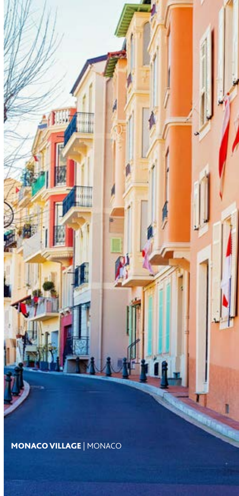
MONACO VILLAGE | MONACO

The state has no income tax and low business taxes but still levies VAT and has high social insurance taxes for employers and employees. Although not part of the EU, Monaco complies with many European laws and regulations and has a strong international presence.