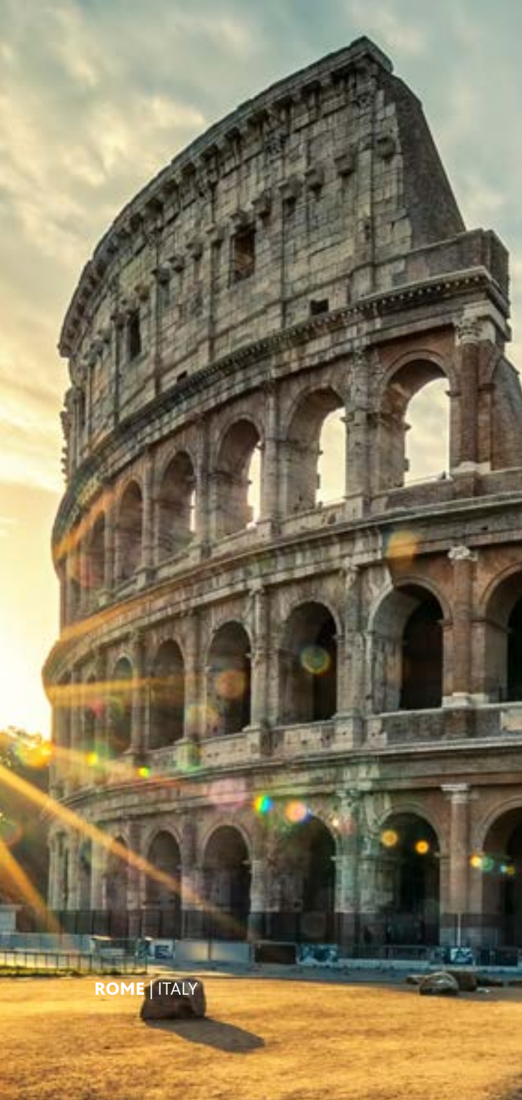
ROME | ITALY